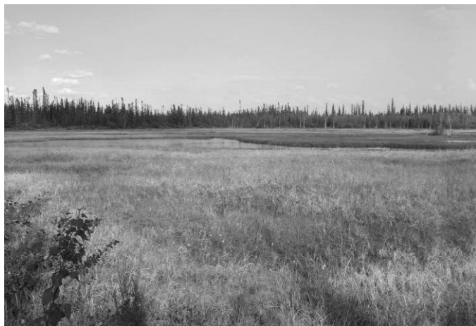
Chena Flats Greenbelt property transferred to the Fairbanks North Star Borough

The Chena Flats Greenbelt Project has currently conserved for future generations over 270 acres between Chena Ridge and Chena Pump Road. These properties not only provide open-space to the neighborhood, but are also high-biological value wetlands, providing wildlife habitat and watershed services such as floodwater storage.